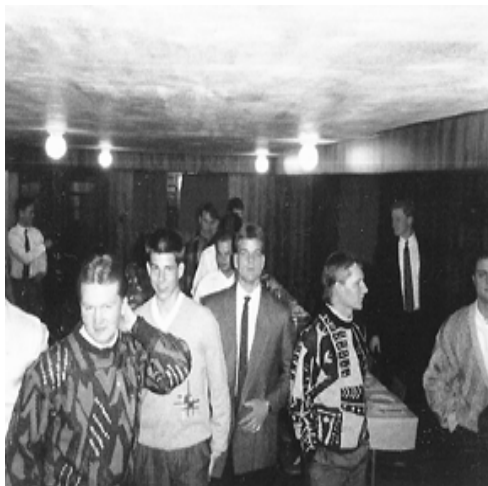
Actives from 91-92 after Monday Night Meal.