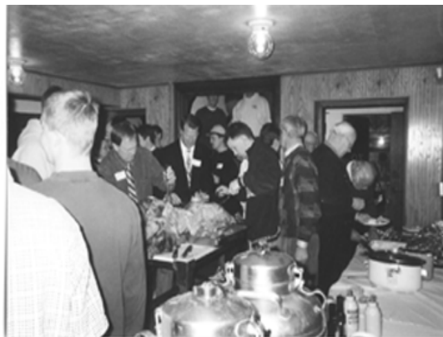
Pig Banquet 2003