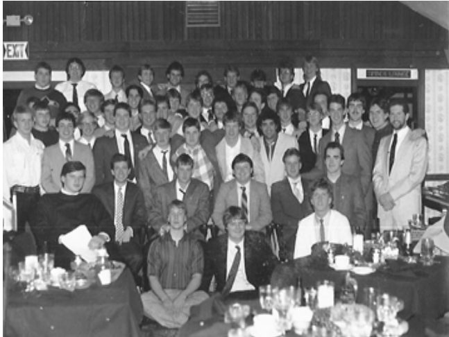
Active Chapter from 86-87