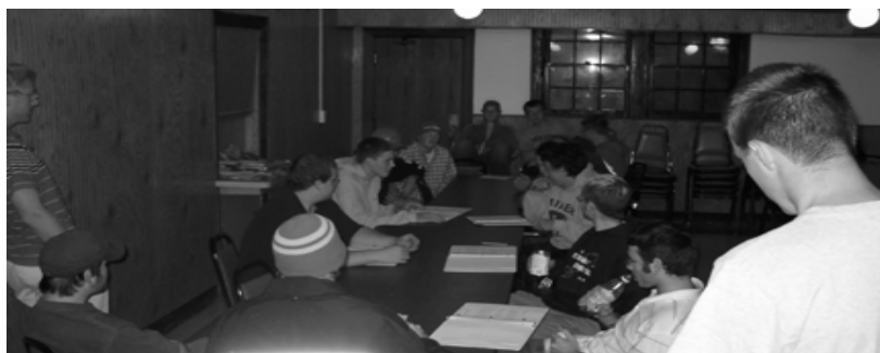
Actives and Pledges at Pledge Class, Fall 2003