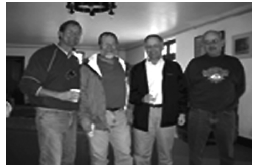
Phi alum hanging out at the house during homecoming.