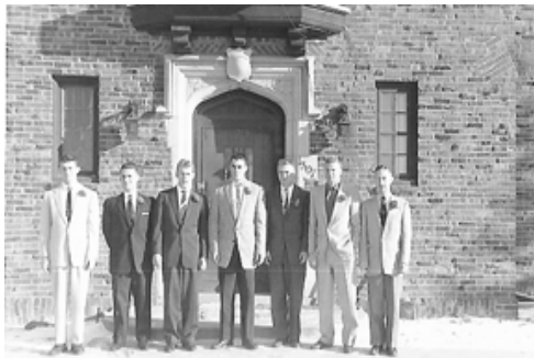
New Members 54-55