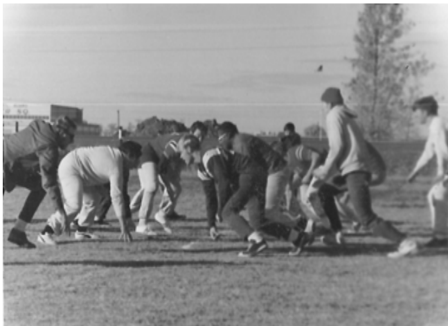
Theta Chi Intramural Football Team 69-70, it's a wonder why no one went on to the Pro's.