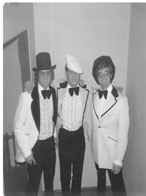
Theta Chi Formal Term Party 74-75, do I even have to comment.