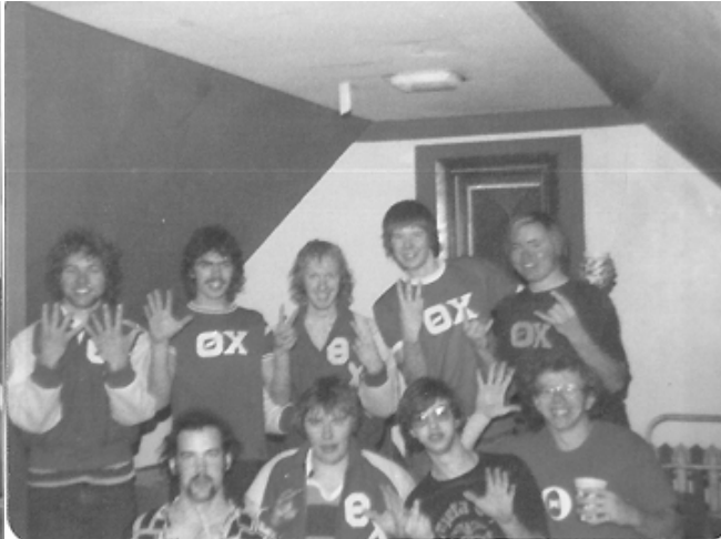
Actives and Pledges from 76-77, they must be showing their signs from the hood.