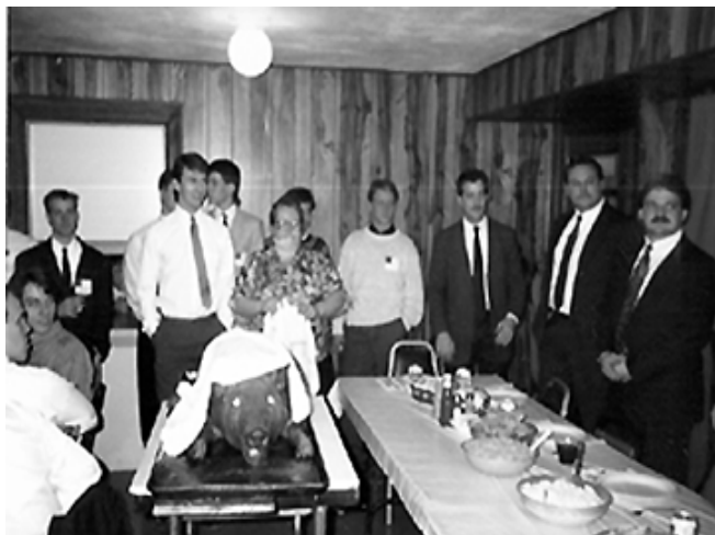
Pig Banquet 1992, even the pig looks like it's having a good time.