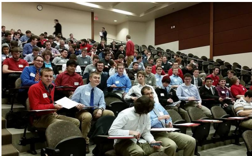
Nearly 150 brothers were in attendance from across the Midwest