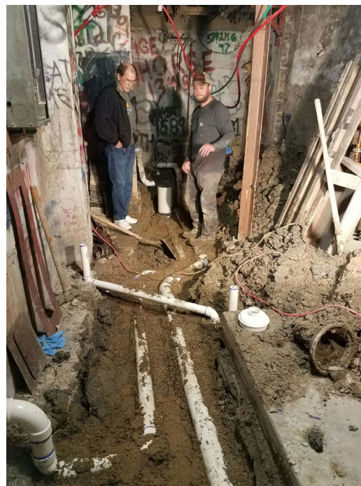
Check out the exquisite wall art viewed from the north side of the boiler room! New pipes have been installed to service the expanded kitchen. Apparently someone found the key to Theta Chi and promptly removed the entire incinerator.