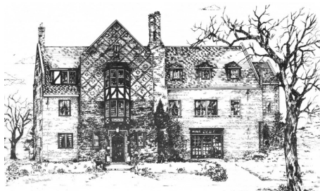
Theta Chi Fraternity Phi Chapter Fargo, North Dakota