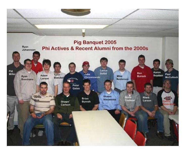
Family Social at Theta Chi House Lunch at Theta Chi House Meeting Social at Theta Chi House or Chubs Supper at Fargo VFW

11:30 am 12:30 am 2:00 pm 5:00 pm 6:30 pm