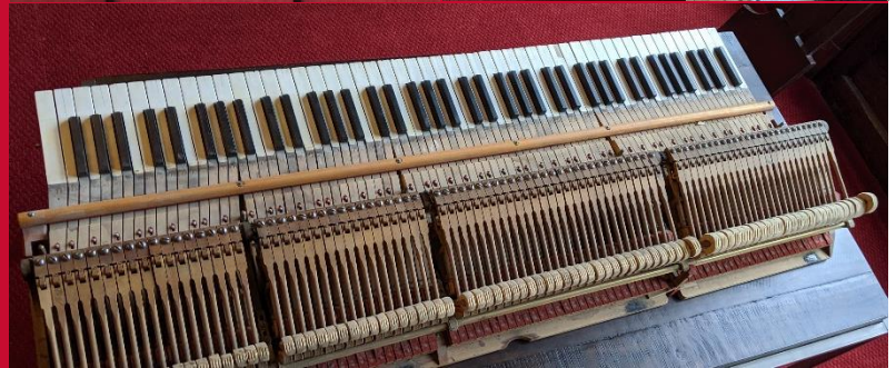
Above: the Steinway is pictured as it was being disassembled in 2019