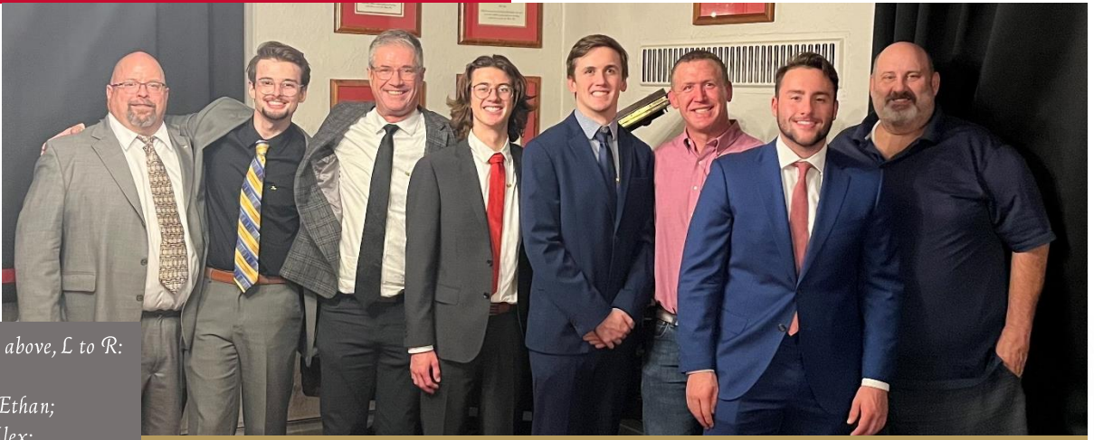
Pictured above, L to R: