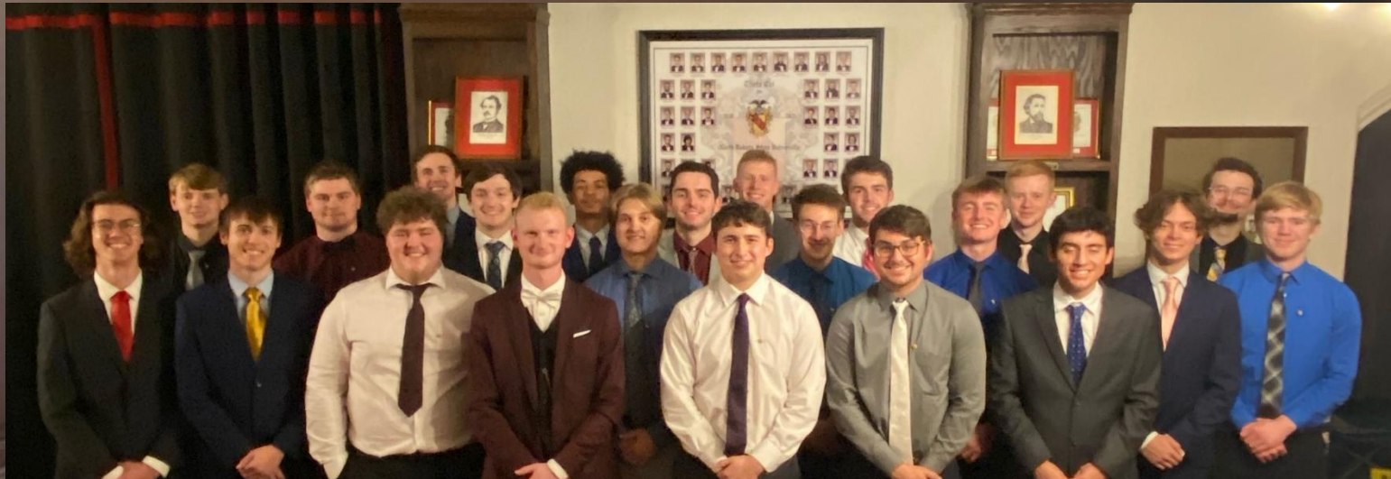
The new initiates from the fall of 2021 pose on main for a group photo