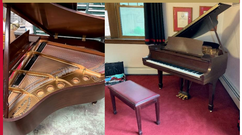
Below: the Steinway is fully rebuilt, restrung, refinished and ready to be played.