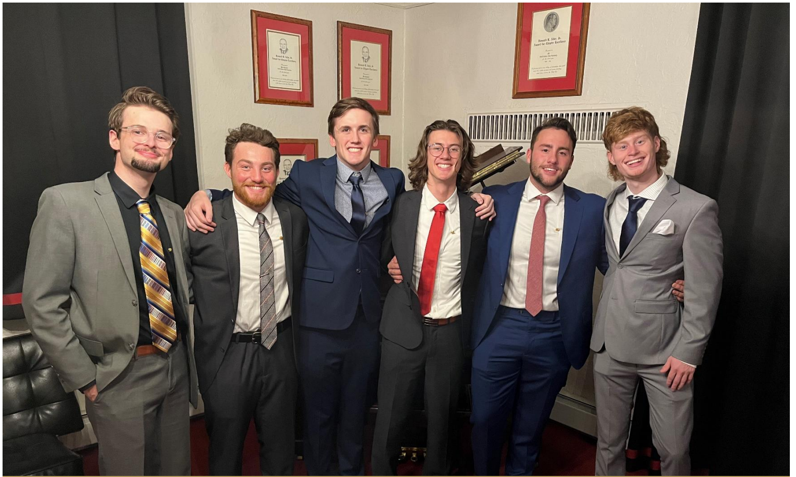
A few of the current undergraduate legacies