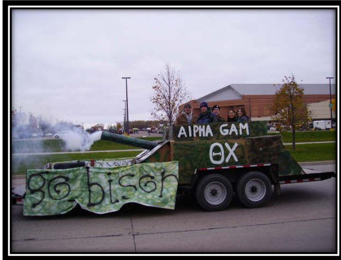
Theta Chi's Float for the 2005 Homecoming