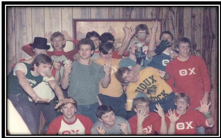
Having fun in the basement!!