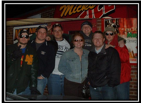
Going out on the town!!