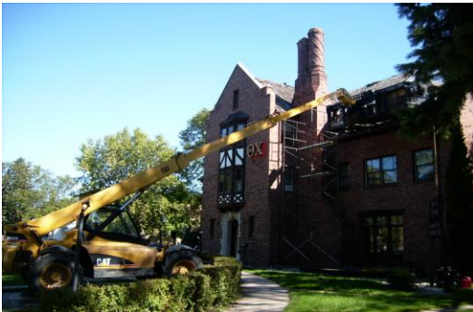
Finishing up the front of the house