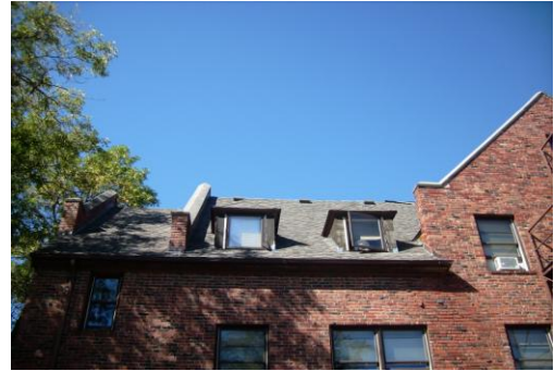
Working on the back side of the house