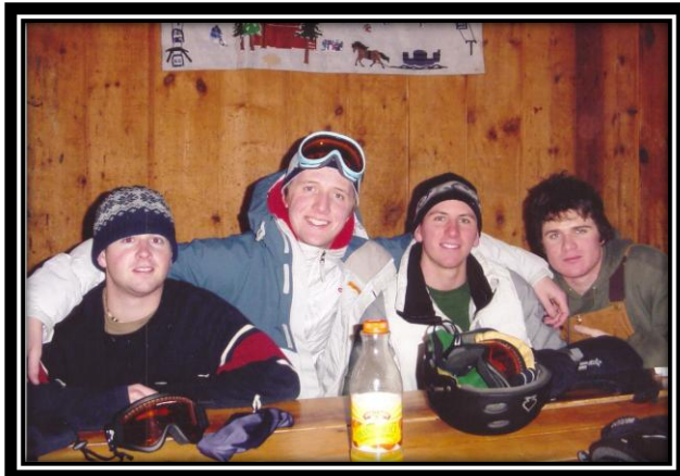
Just the Guys!!