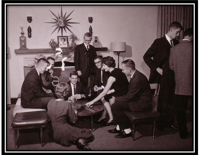
Just the good ole times!!