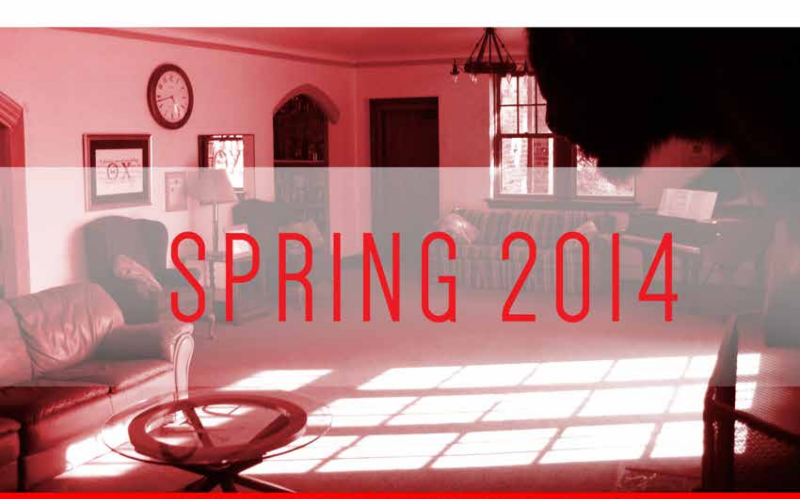
ΘX "THE HOUSE THAT BROTHERHOOD BUILT" Φ