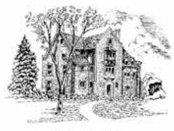
THETA CHI 1307 North University Drive Fargo, ND 58102